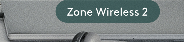
Zone Wireless 2