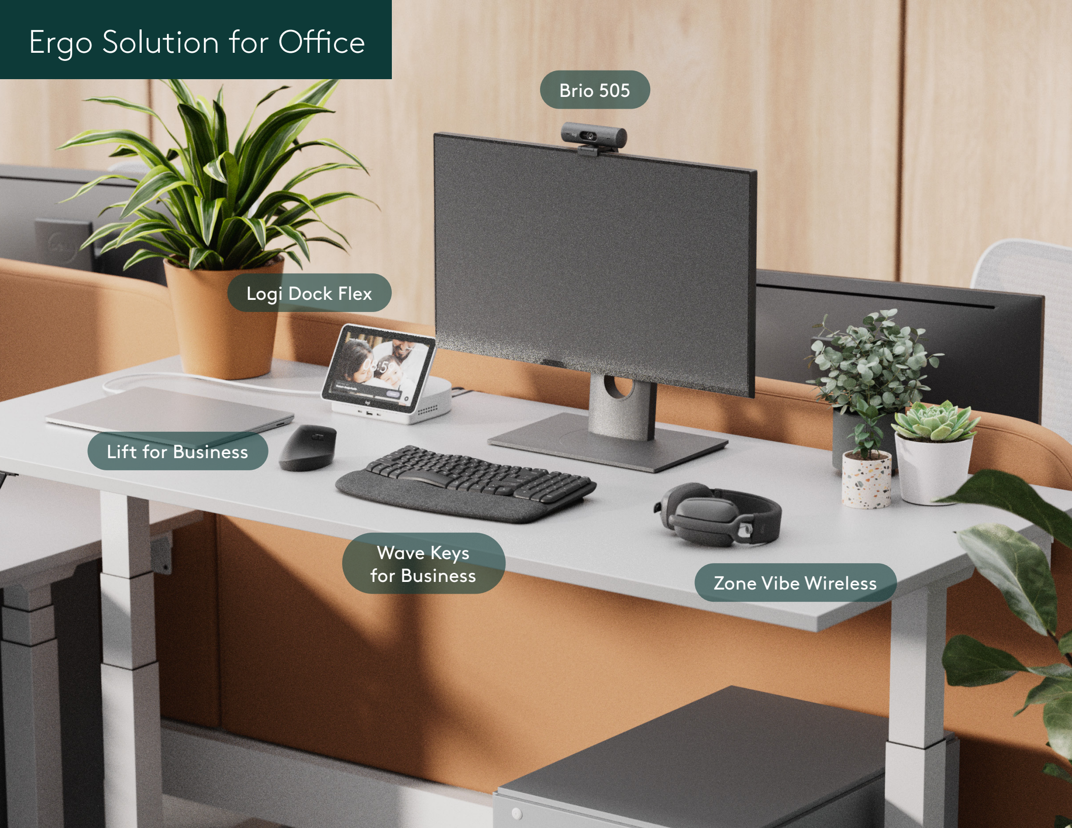
Zone Vibe Wireless