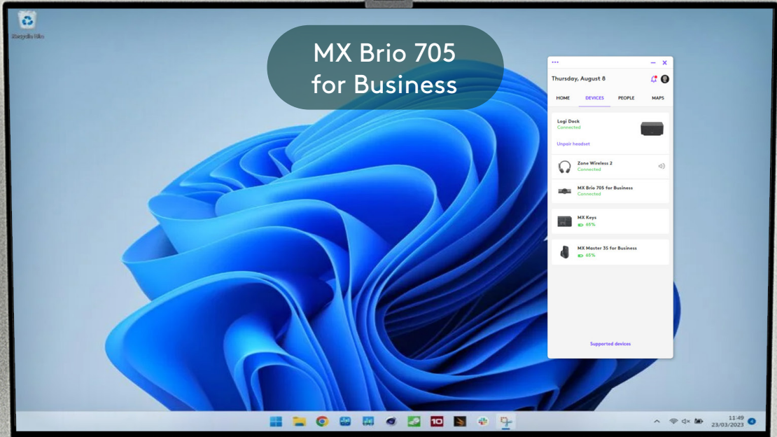
MX Brio 705 for Business